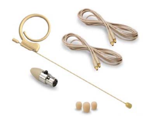
The HS-48a features an adjustable length boom and a distinctive flexible ear-hook made with a self-adjusting soft spring polymer that eliminates the frustration of getting a secure and comfortable fit regardless of who is using it!

The HS-48a is available in black, cocoa brown or beige and ships in a leatherette case. This comfortable single ear headworn mic is a perfect solution for Houses of Worship, Theaters, Lecturers, Broadcast, Corporate A/V, and other applications where intelligible sound and low visibility are required.