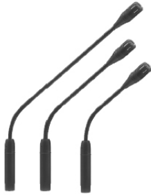
E321L, E321M, E321S

The Superlux E321 Series of gooseneck quick-mount back-electret condenser microphones are designed primarily for speech and vocal reinforcement applications. The E321 is available in three overall lengths; 12, 18 and 24 inches and in a number of configurations with features such as a large 16mm diaphragm, RF shielding, high pass filters, on/off switches and status light rings. These versatile install products are ideal in boardrooms, conference and meeting rooms, simultaneous translation environments, council chambers, courtrooms, and places of worship. Whether on a lectern or pulpit, on a desktop or conference table, the Superlux family of gooseneck microphones are the perfect solution.